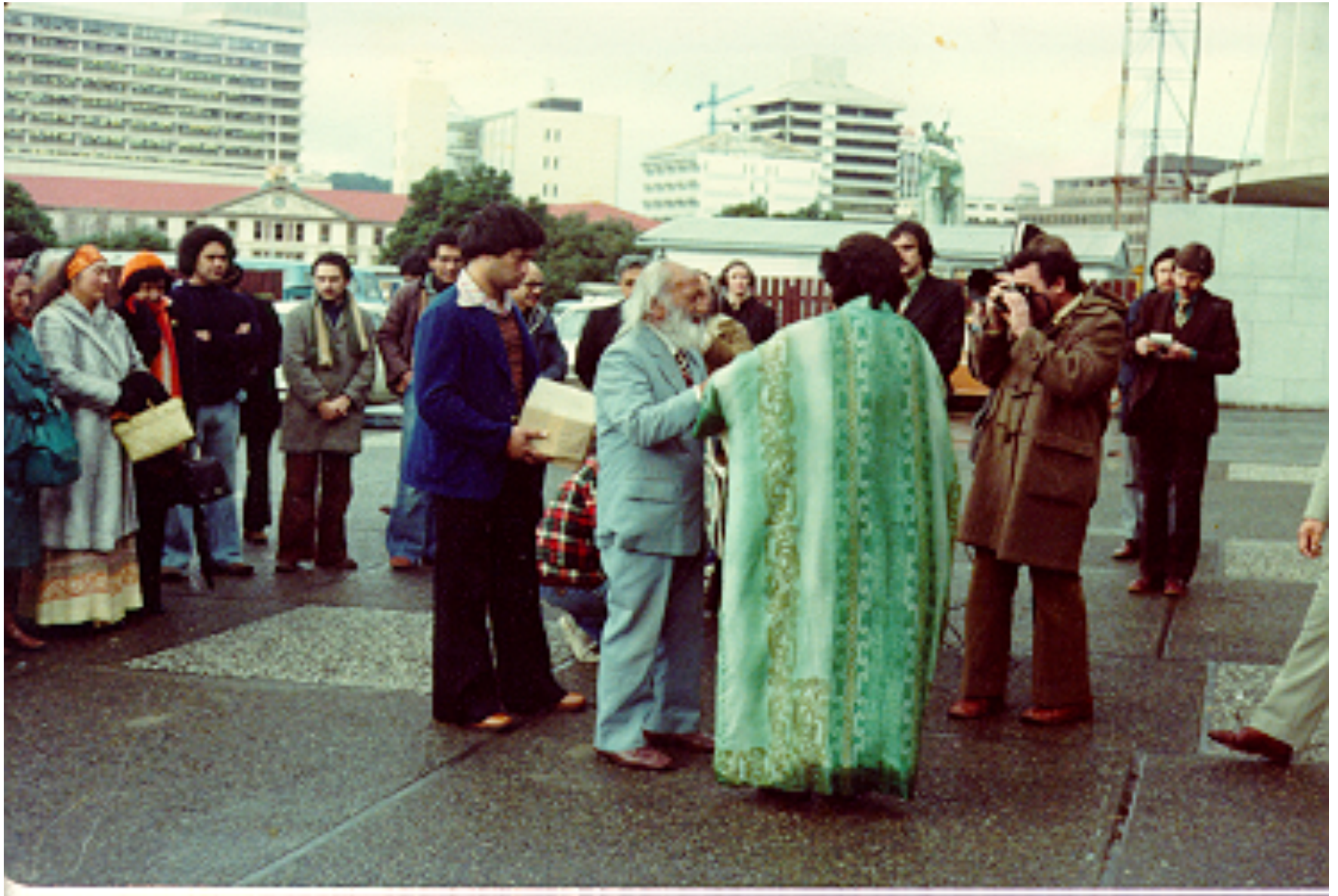
In 1978 there was another Petition - for broadcasting assets