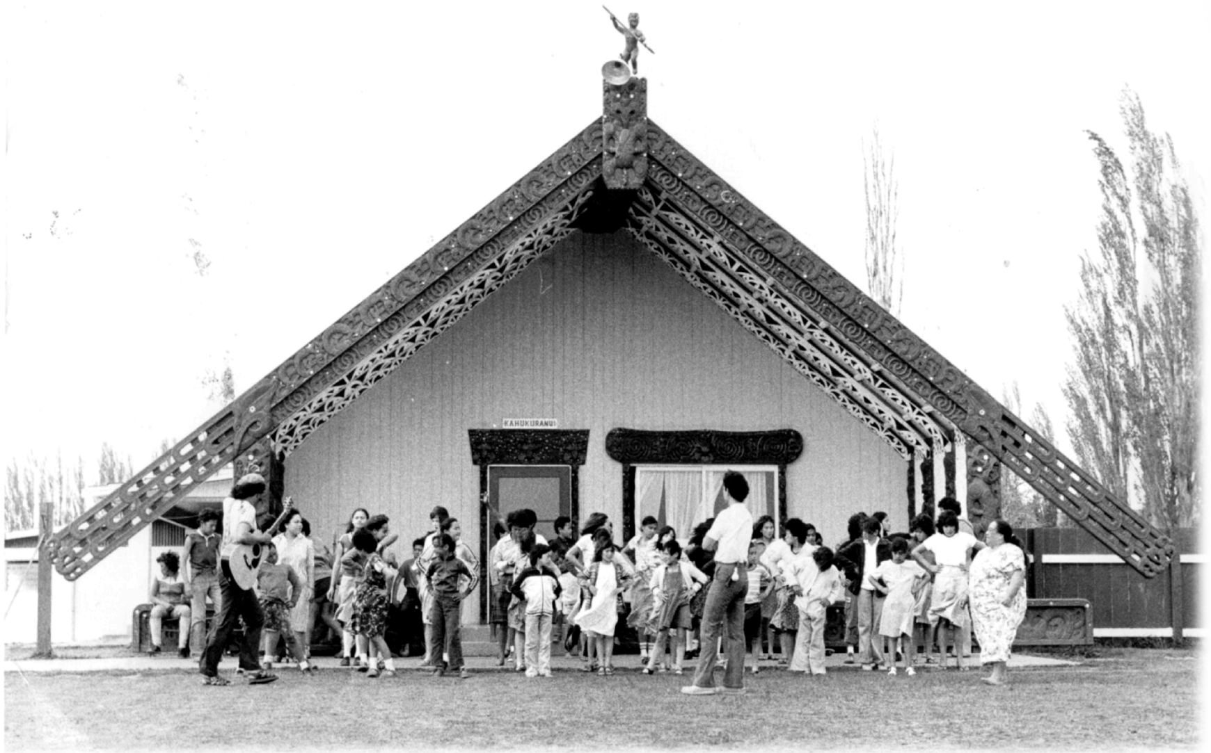
Education: Ōmāhu Pilot Bilingual School pupils at village marae