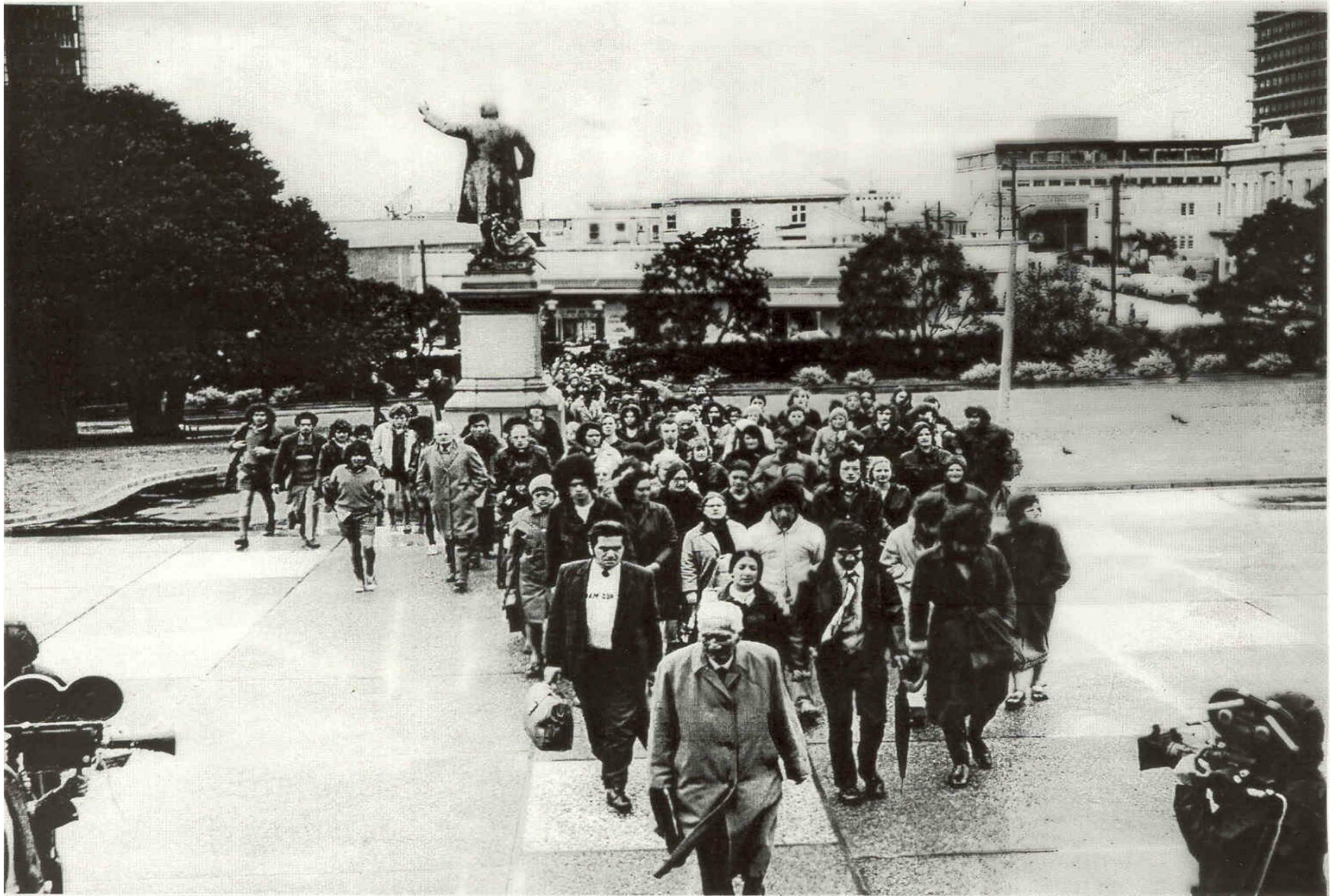
The presentation of the Te Reo Māori Petition, 1972